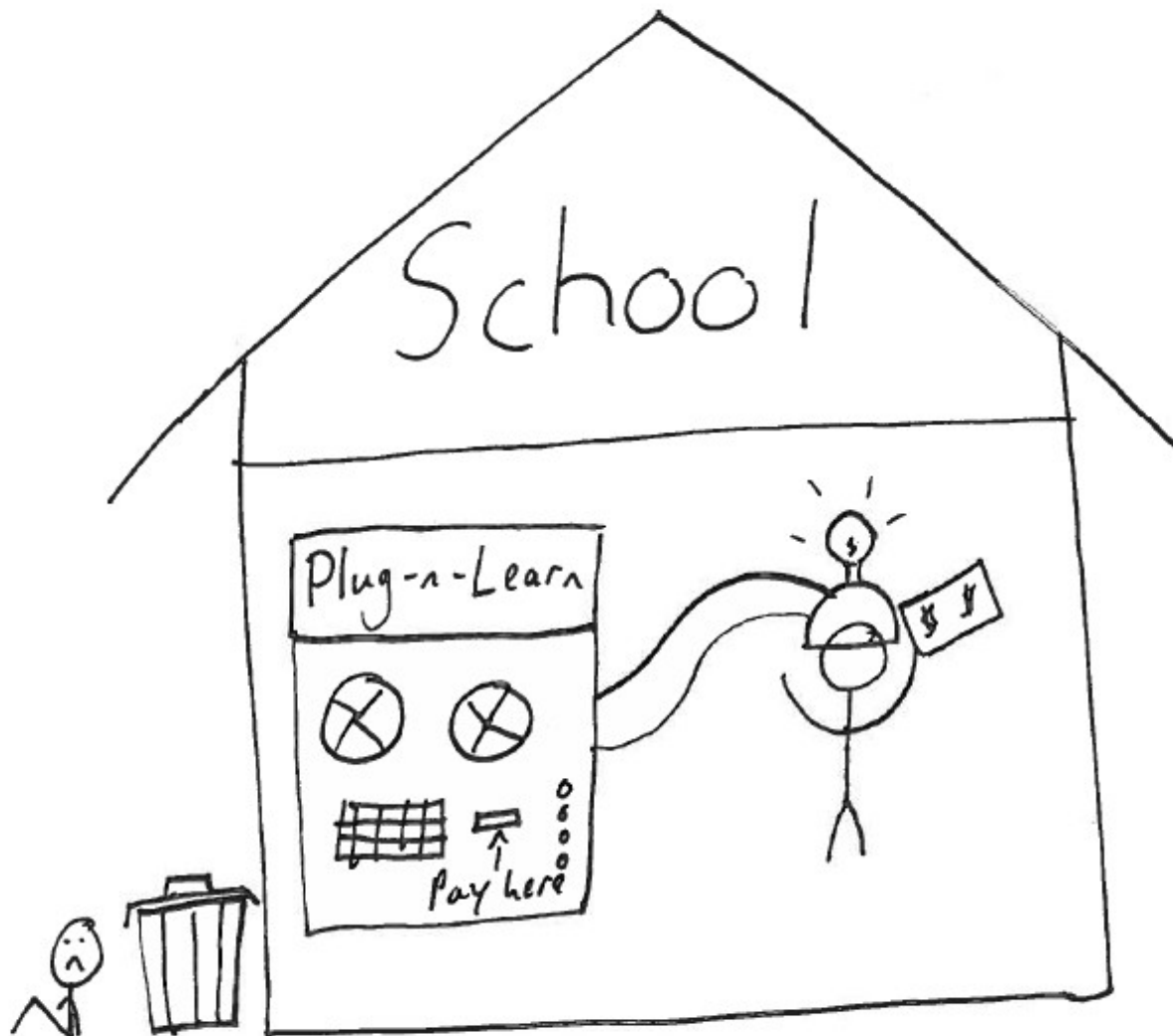
Figure 1: Example of an Image from a Causal Layered Analysis

This drawing belongs to the Systemic Causes level of one group's causal layered analysis. It displays a dystopian future scenario in which the Plug-n-Learn, a device that allows someone to connect their brain to a computer that inputs knowledge in an instant, has been invented. In this dystopian scenario, a rich person is shown as being able to afford to use the Plug-n-Learn, but a poor person is unable to afford education and forced to live on the street.